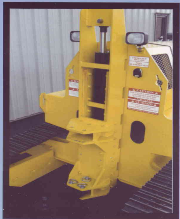
STANDARD 26,000 LB CAPACITY MAST