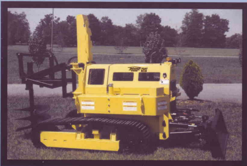
465 SHOWN WITH DOZER BLADE OPTION AND AUGER ATTACHMENT