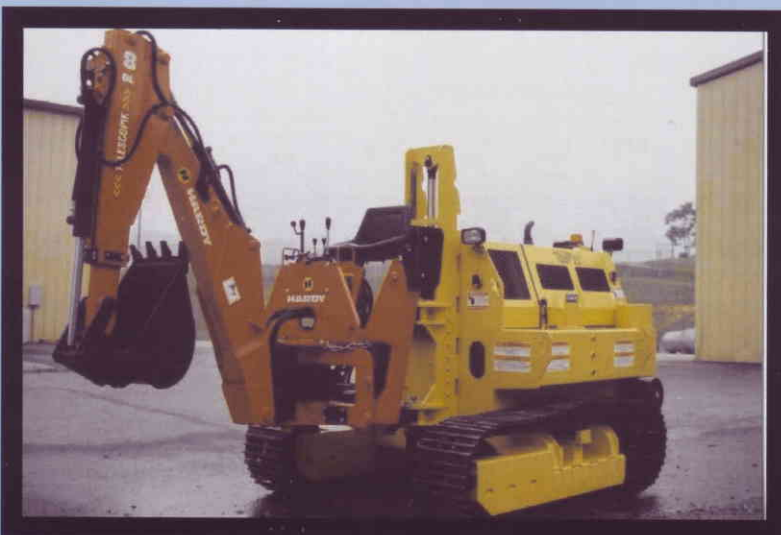
465 SHOWN WITH OPTIONAL BACKHOE ATTACHMENT